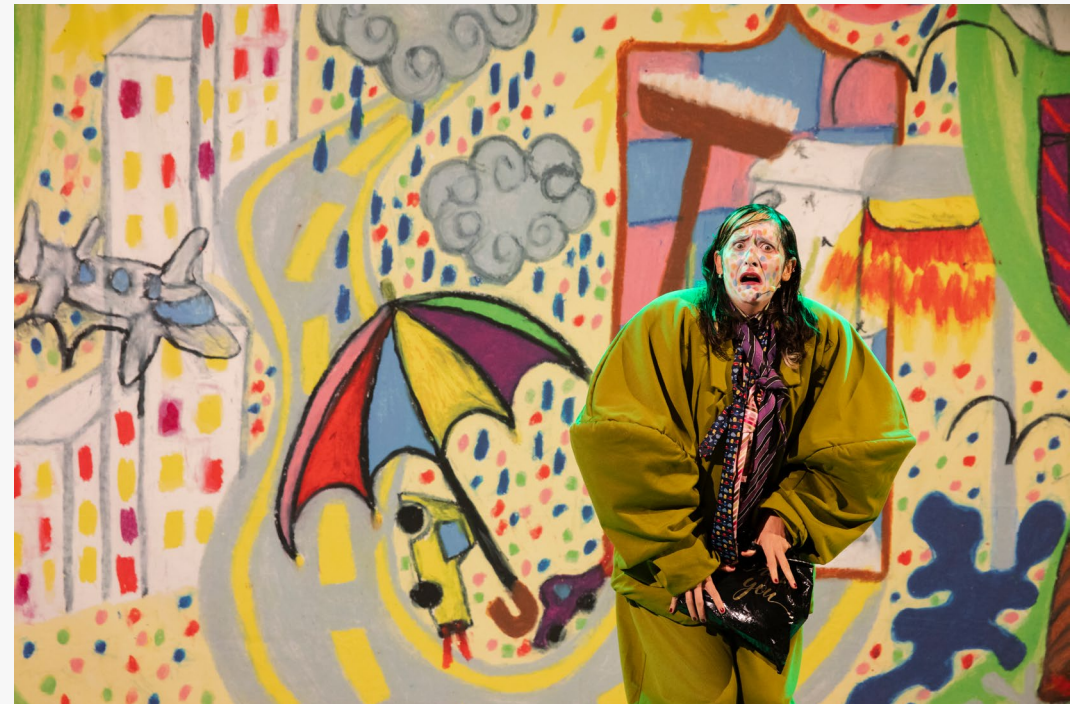
Le Fabuleux Destin de Monsieur Della Merde Performance, Fondazione Sant'Elia, Palermo (IT), 2025