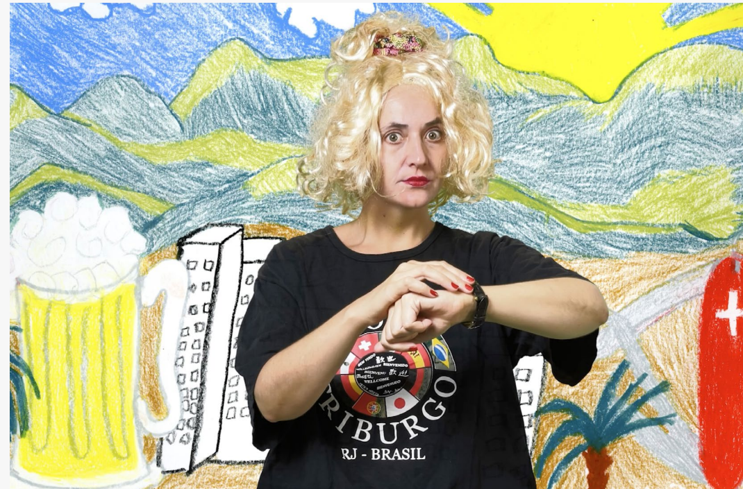
Miasma Ficção Video, 25:39, 2023