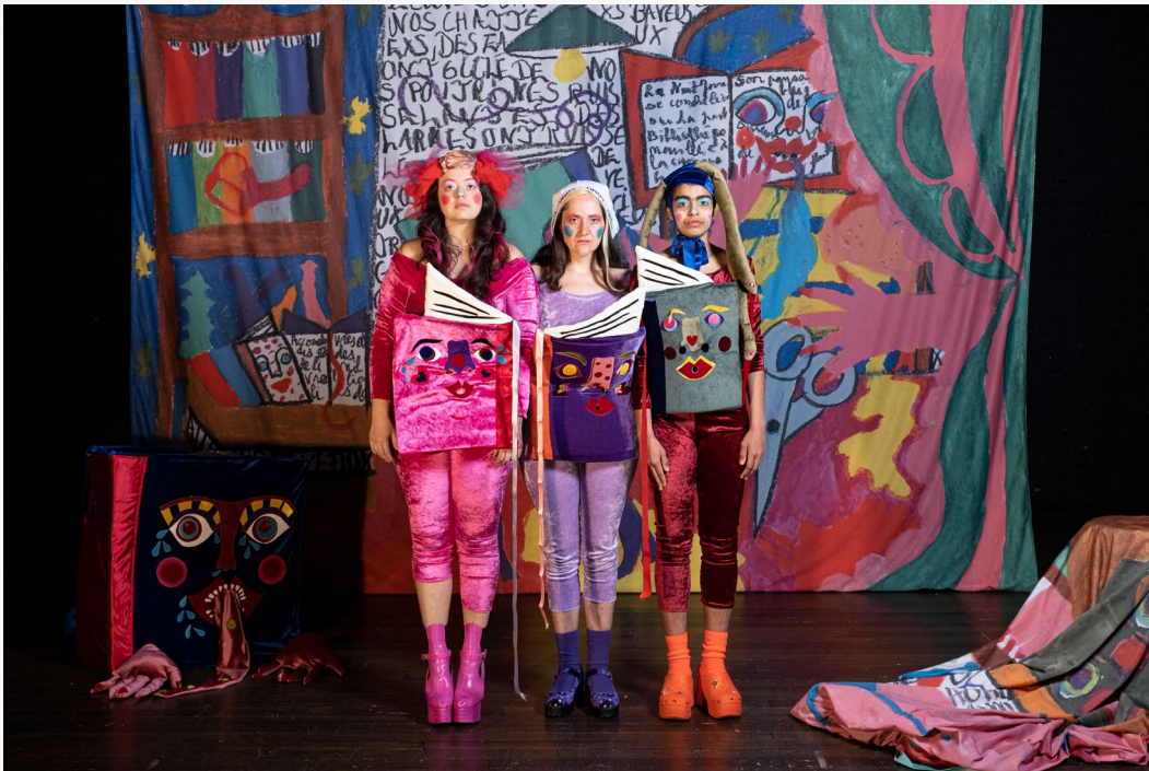
La Grande-Bibliothèque-Honteuse Performance, 80:00, Arsenic, Lausanne, 2026

Partnerships: Théâtre Saint-Gervais, L'Abri, Geneva.